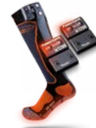
BATTERY PACK IC 1200 + UNI HEAT

SIZE ART.-NO. 35-38 T01-0110-040_01 39-41 T01-0110-040_02 42-44 T01-0110-040_03 45-47 T01-0110-040_04