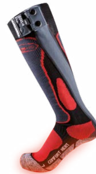
POWERSOCK COMFORT HEAT MEN

Anatomically knitted for ideal fit for male feet.