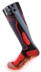
POWERSOCK COMFORT HEAT MEN

SIZE ART.-NO. 35-36 T01-0500-002_01 37-38 T01-0500-002_02 39-40 T01-0500-002_03 41-42 T01-0500-002_04