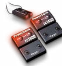
BATTERY PACK RC 1400