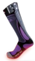
POWERSOCK COMFORT HEAT LADIES

SIZE ART.-NO. 35-36 T01-0500-002_01 37-38 T01-0500-002_02 39-40 T01-0500-002_03 41-42 T01-0500-002_04