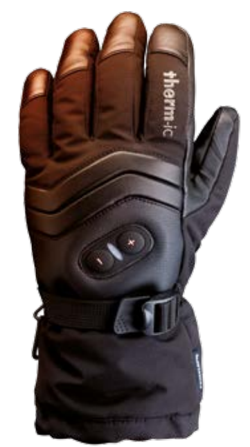
POWERGLOVES IC 1300 LADIES