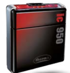
SMARTPACK IC 950

ART.-NO. T01-0110-010 (EU, US) T01-0160-009 (UK)