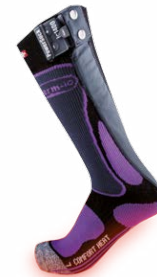
POWERSOCK COMFORT HEAT LADIES

Anatomically knitted for ideal fit for female feet.