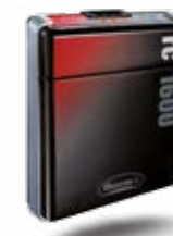
SMARTPACK RC 1600