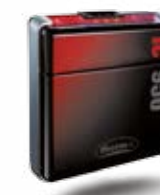
SMARTPACK IC 950