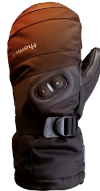
POWERGLOVES IC 1300 MITTENS UNI