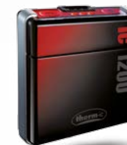
SMARTPACK IC 1200

ART.-NO. T01-0110-009 (EU, US) T01-0160-008 (UK)