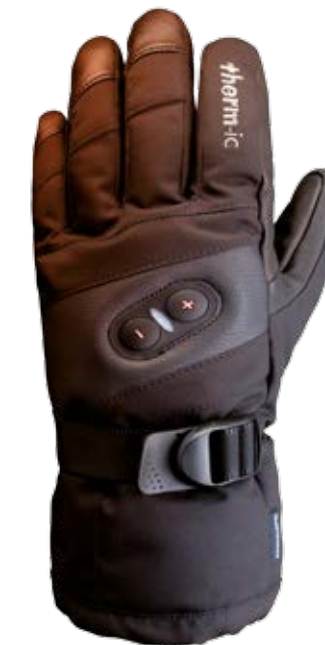
POWERGLOVES IC 1300 MEN