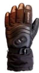
POWERGLOVES IC 1300 LADIES