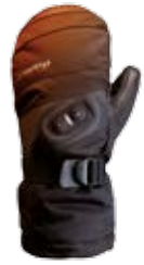
POWERGLOVES IC 1300 MITTENS UNI