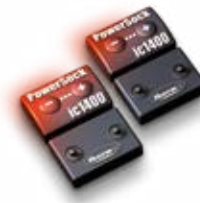
BATTERY PACK IC 1400