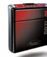
SMARTPACK IC 1200