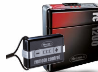
SMARTPACK RC 1200

This SmartPack is also equipped with a remote control and suitable for intensive usage: it keeps your feet warm for up to 22 hours.