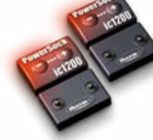
BATTERY PACK IC 1200