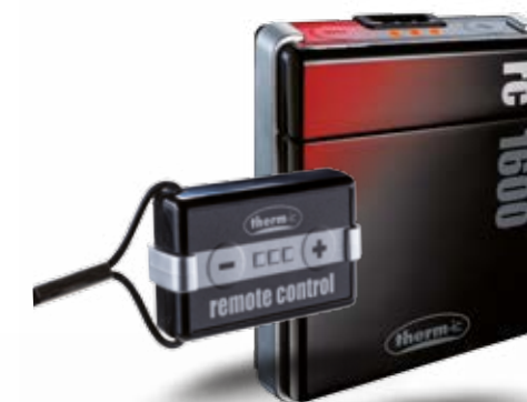
SMARTPACK RC 1600

The strongest: this SmartPack guarantees energy for up to 29 hours. You can regulate the temperature with a remote control.