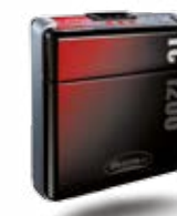
SMARTPACK RC 1200