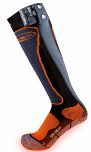
POWERSOCK UNI HEAT

Functional allround sock, ideal for all outdoor activities.