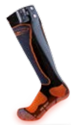
POWERSOCK UNI HEAT

SIZE ART.-NO. 39-41 T01-0501-002_02 42-44 T01-0501-002_03 45-47 T01-0501-002_04